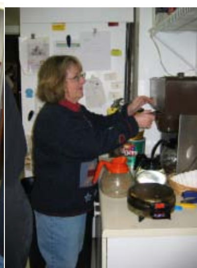
Our folks are pitching in to help with breakfast at the seminar